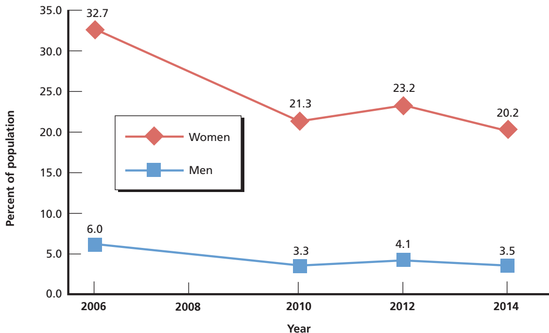
Figure 2 Estimated Percentages of Active-Duty Men and Women Who Experienced Sexual Harassment in the Past Year, as Defined by the WGRA Methodology, 2006–2014

Note: 2006 estimates are for calendar year 2006. Estimates for 2010, 2012, and 2014 are for a time period closer to the fiscal year.