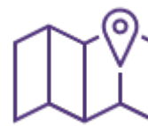
Date & location of the offense